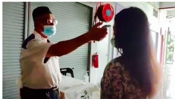
Figure 6: Temperature Taken before Entering Trading Area