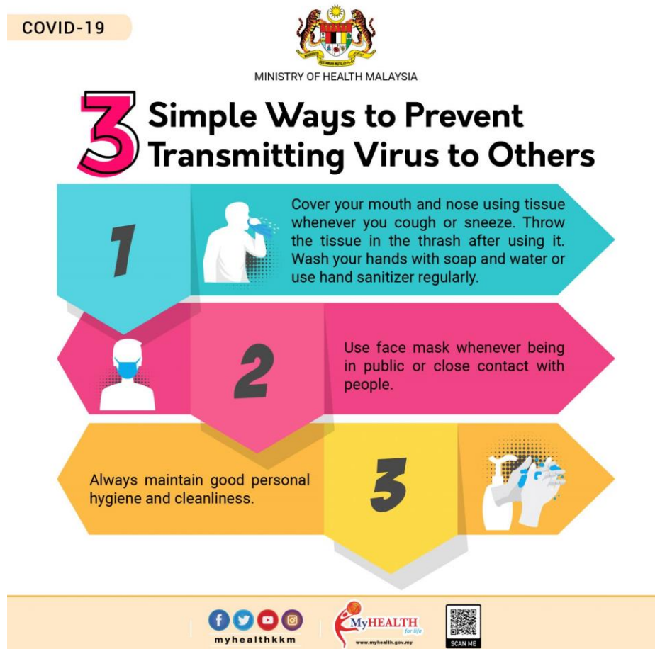
Figure 1: Preventing Spreading of Virus (Malaysia Ministry of Health, n.d.)

Malaysia was no exception to this virus, more than 7000 infections and more than 100 deaths recorded (as of this article written, 23 May 2020). The steep growth in the infections in March and April shook the entire nation and increased the fear on this virus. This deadly virus was detrimental to socio-economy of all nations, impacting financial, manufacturing, aviation, tourism and many other industries and resulted in unemployment, changes in academic calendar and other issues. Aligned to the declaration of corona virus as pandemic by WHO, Malaysian government announced Movement Control Order (MCO) mandating lockdown of all sectors except essential services. It was an approach to reduce mobility of people to stop the spreading of virus. Everyone was asked to stay at home which initiated work from home and school from home, utilizing the online platform. Social distancing of 1 meter in public, wearing of face mask and frequently sanitizing hands were emphasized to be adopted as new lifestyle (Malaysia Ministry of Health, 2020, n.d.). Please refer to figure 1 for guide from Malaysia Ministry of Health in preventing transmission of corona virus.