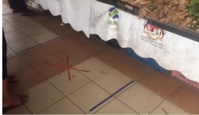
Figure 4: Marked Points inside the Market

As shown in figure 5 and 6, in a visit to a supermarket, similar SOP was noticed, i.e. wearing of mask, taking temperature, sanitizing hands and additionally, token is given to each customer entering the supermarket. Floors are marked to enable distancing of 1 meter. Traders displayed notice mentioning entry will not be allowed for customers without mask. There were certain outlets in the supermarket allowed limited customers such as 5 at a time. Certain traders arranged for external counters to take orders, pick the items and hand it over to customers upon payment done.