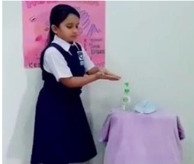
Figure 2: Student Demonstrating Hand Sanitization

stop the spreading of virus. Student demonstrating hand sanitization has been provided in figure 2.