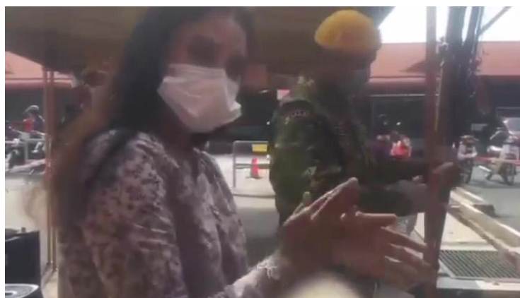
Figure 3: SOP managed by Army

Government has also established restrictions and guidelines or SOP to be adhered in public places. Observation was done at a wet market in the town of Changlun, Kedah, a place daily visited by many people. Movement of people and interaction with the traders are unavoidable. Everyone is required to adhere to the SOP and Malaysian army has been tasked to manage adherence. Entrance and exit are separated. As shown in figure 3, everyone is required to wear mask, to be in queue with 1-meter distance, got through temperature reading, sanitize their hands and finally enter the market. People are to follow the marked points, as shown in figure 4, at the stalls and walkways to enable the distancing of 1 meter. Police was placed inside the market to monitor the public movement and adherence of the SOP.