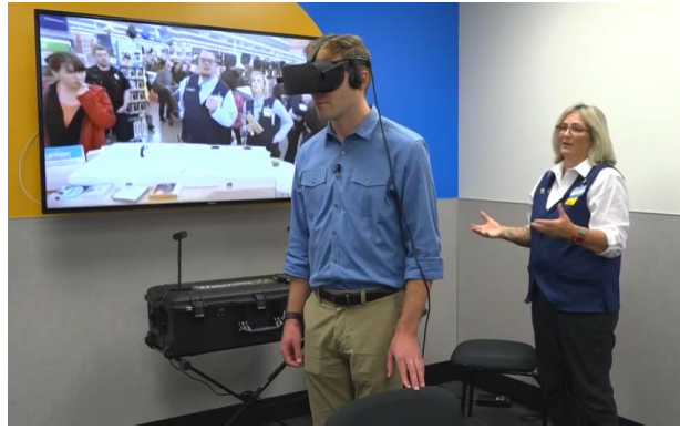
Figure 1: Store Manager Training via Virtual Reality in Walmart (WTSP, 2018)

VR experiences might also be designed for different purposes (Sherman & Craig, 2018), such as analyzing big data and solving problems in engineering, education, and healthcare industries (Huang, Rauch, & Liaw, 2010). On the other hand, VR applications can be designed to provide factual information to users regarding significantly large or small but complicated designs such as a building or a molecule. VR is a very useful tool to visualize complex and abstract information or problems and breakdown them into more meaningful parts to foster understanding, creativity and problem-solving ability.