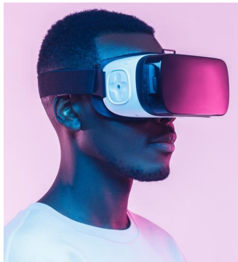
Figure 2: Head-Mounted Display (HMD) (Marchionne, 2019)

Despite its proven benefits, however, there is a lack of research on how to select the appropriate VR tool. Aiming to address this gap, this study focuses on obtaining an answer to “What are the important decision criteria for selecting and investing in a VR tool?”. This paper provides a holistic view of VR utilization across industries aiming at identifying and consolidating relevant decision criteria for the selection of appropriate VR solutions. The sole focus of the study is on VR tools that are designed for individual experience via a head-mounted display with audio as is shown in Figure 2. That is the VR tools that allow multiple user interactions in a collaborative virtual environment such as VR based games are not considered.