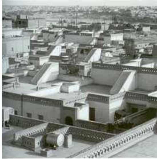
Figure 1: A view to "suoushtar new town"