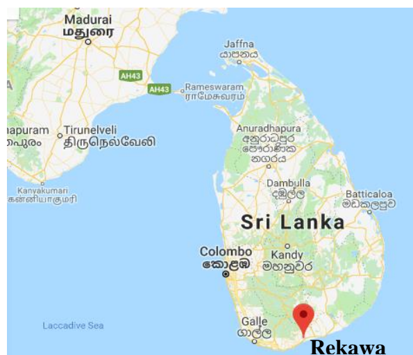
Figure 1: Rekawa in Sri Lankan map

Rakawa Lagoon is located in the coastal belt of Hambanthota district in the southern province of Sri Lanka which receives annual rainfall between 1270-1910 mm (IUCN, 2004). A monospecific Ceriops tagal forest in Rakawa Lagoon was selected for the study in the month of July 2013 and 2014. Six (4m 2 ) plots were randomly selected including three plots in open canopy site (caused by tree cutting) and another three plots in adjacent undisturbed closed canopy site (Figure 01 & 02).