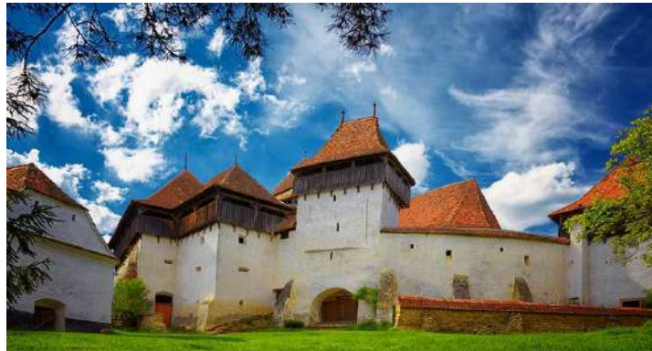
Figure 1: The Fortified Church - Viscri Village

The cultural heritage of the village includes the Fortified Evangelical Church, the architecture of the village houses, as well as the customs and traditions of the locals. Both the village and the fortified church in Viscri are included in the UNESCO heritage list, and this has contributed to the attraction of tourists in the area. The locals have set up a museum with popular objects and costumes where tourists are told about the history, traditions and culture of the village.