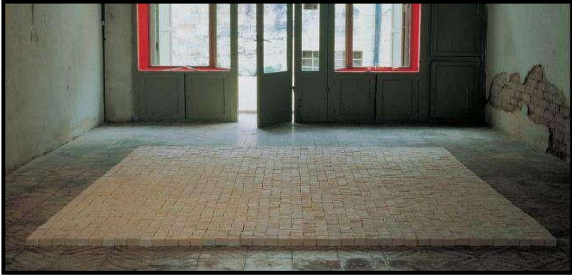
Figure 1: Mona Hatoum, Present Tense, 1996, soap and glass beads, 4.5x241x299

producing this soap; however, people produce it in all Palestinian cities calling it the original Palestinian soap because they make with Palestinian olive oil.