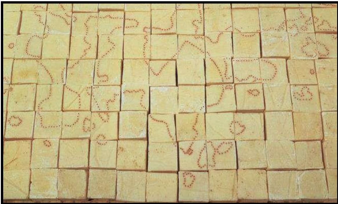
Figure 2 (Detail): Mona Hatoum, Present Tense, 1996, soap and glass beads, 4.5x241x299

In Mona Hatoum's artwork the use of soap is significant because she represented an important issue from her personal environment which is real because it is full of social and