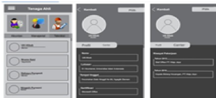
Figure 4: Prototype Engineer Menu