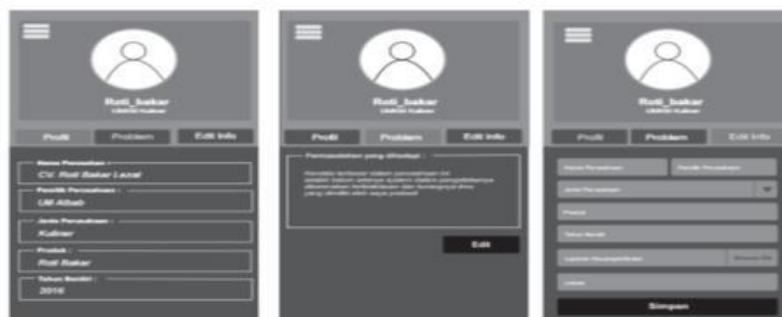
Figure 2: Prototype Menu SMEs