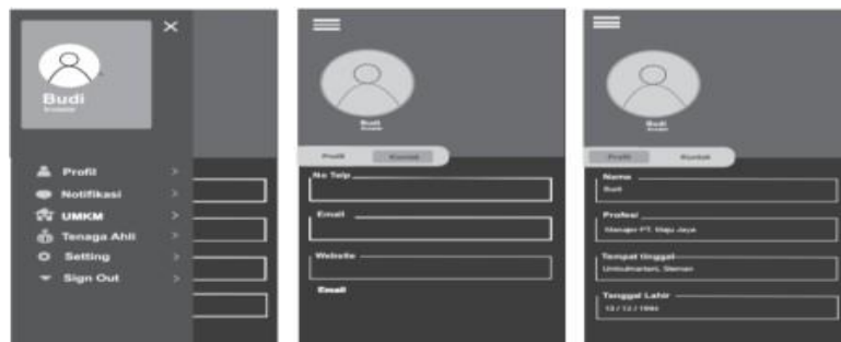
Figure 6: Prototype Investor Menu