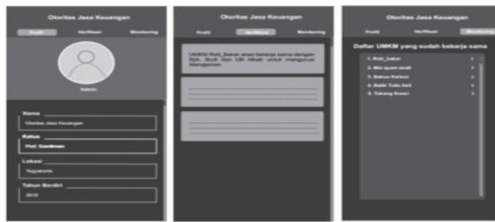
Figure 7: Prototype FSA Menu