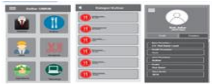
Figure 3: Prototype Register