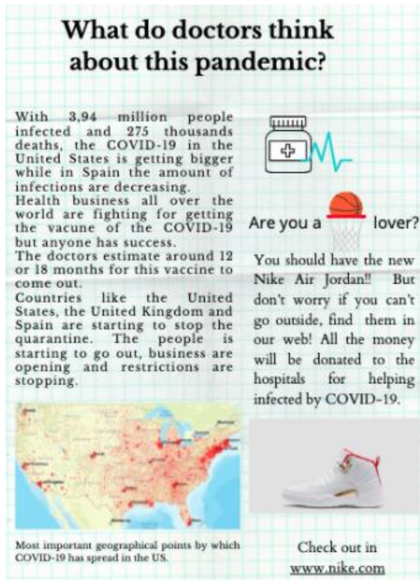
Figure 1: Journalistic article Developed by a Student about the COVID-19 Pandemic

From a generic perspective, students have been observed taking into account their written skills throughout written comprehension and written production of the newspapers' productions. This project has allowed a new practice on new structures and uses of English, as well as the adaptation of EFL in digital learning contexts. Because of the teaching-learning situation provoked by the international pandemic, students have elaborated a project in a digital environment, thus the learning of the objectives mentioned before having been adapted according to the circumstances, needs of the students and their linguistic level.