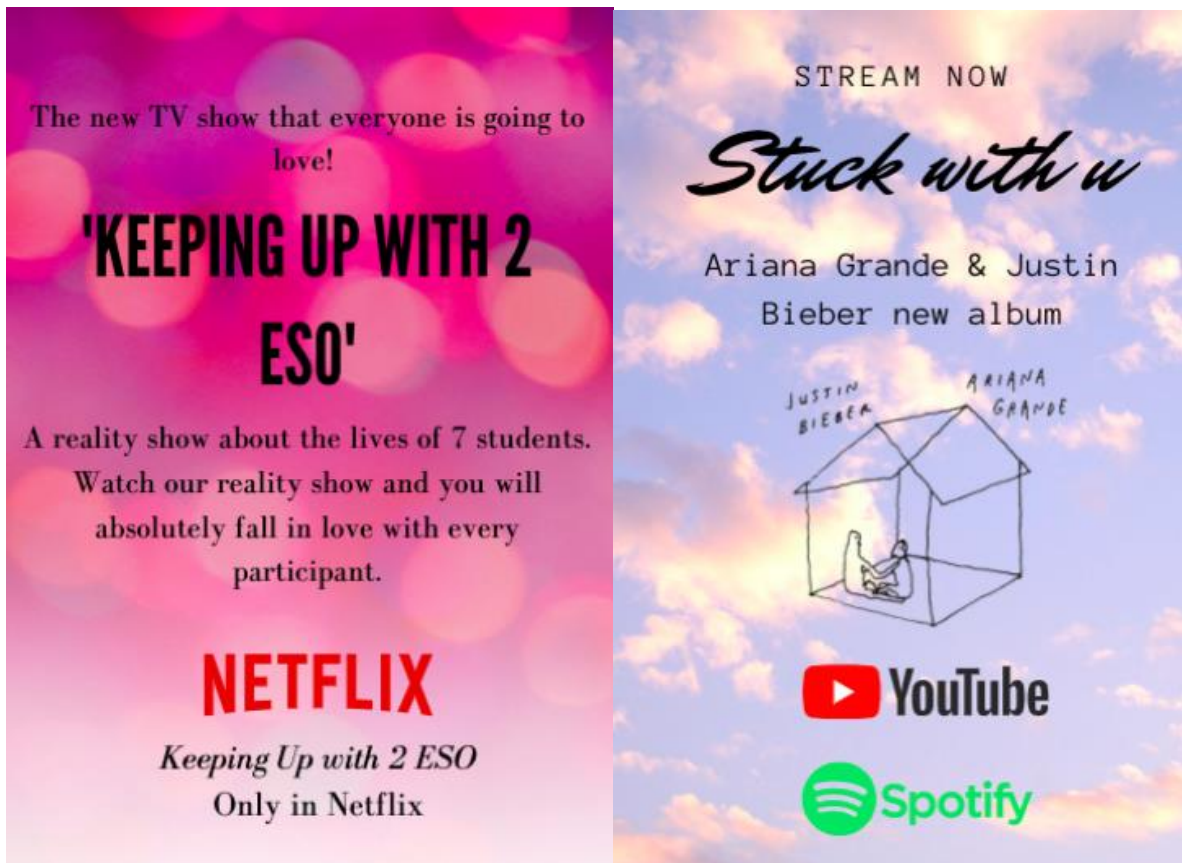
Figures 2 and 3: The Creation of Persuasive Uses by Advertisements

This figure allows the analysis of the informational approach that students are applying using consulting, contrasting and verifying informational sources. There is also a sense of sociocultural knowledge in the foreign language that is created when talking about a different country: The United States of America, in this case. Moreover, communicative functions such as persuasion have been produced by the advertisement that can be seen next to the news. Students have been able to apply persuasive uses in an audio-visual application of the language, and they have been able to combine news and advertisements according to the topic treated. There is a difference in the register applied in the journalistic article from the advertisement. The journalistic article is characterized by the use of a formal register of the English language, whereas the advertisements show up an informal reference to the audience.