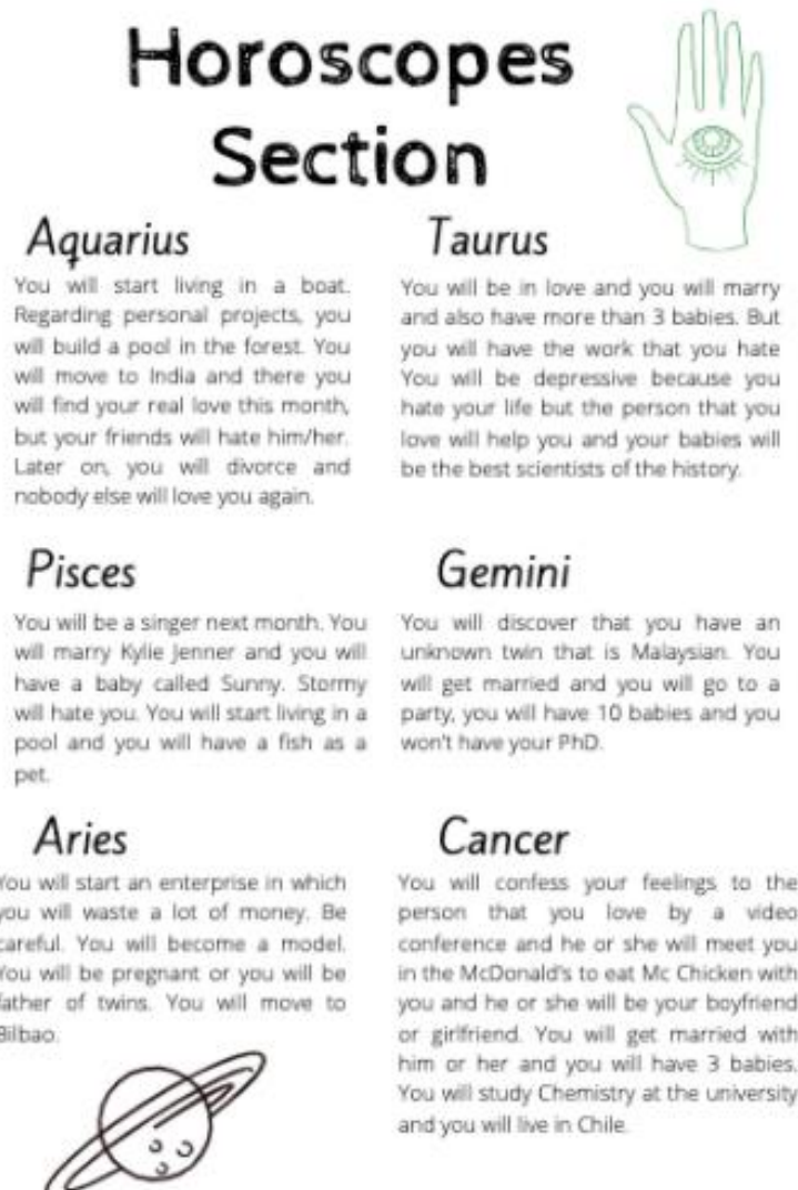
Figure 7: Predictions

most relevant ideas for the text production, dialogues' development, oral text summarization and the literation typically seen in this section.