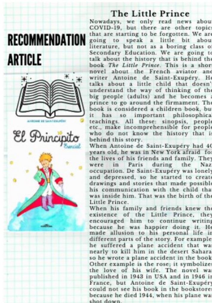
Figure 4: Journalistic Article Created for the Cultural Section

The intercultural competence has been also fostered through creating different sections belonging to a prototypical newspaper, such as the cultural area. In this case, literature has been introduced as a resource for reflection and recommendation for the public. By this type of projects, pupils are not only developing cultural and linguistic knowledge, but they are also taking a literacy piece in which the original language and sociocultural contexts that do not necessarily belong to English-speaking countries. In this sense, pupils' have been able to recognize that English can be utilized to express their ideas and to get to know other cultural codes and productions through speaking in English. Consequently, students have assimilated the idea of English as a lingua franca for the understanding of other sociocultural contexts.