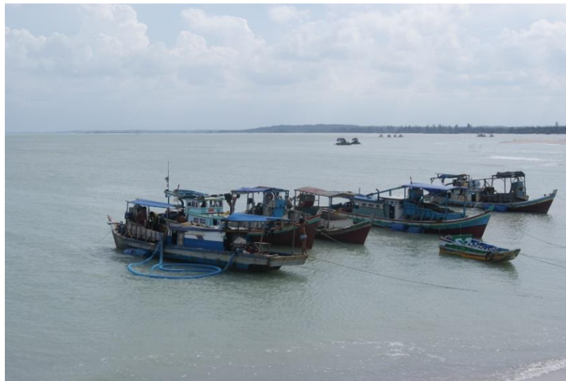
Figure 2: Fishermen's Ships Mingling with 'Apung' Unconventional Mining

The fishermen's disappointment record often ended with demonstration, reserve, hijacking, or burning. However, tin exploration ambition has defeated rationality. The prove is that the businessmen never lose their mind to make approach, either by giving concessionary concession in money for the the surrounding fishermen or by giving lure to get facilities.