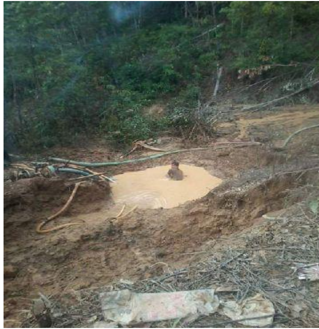
Figure 6: Mining in Forest Area