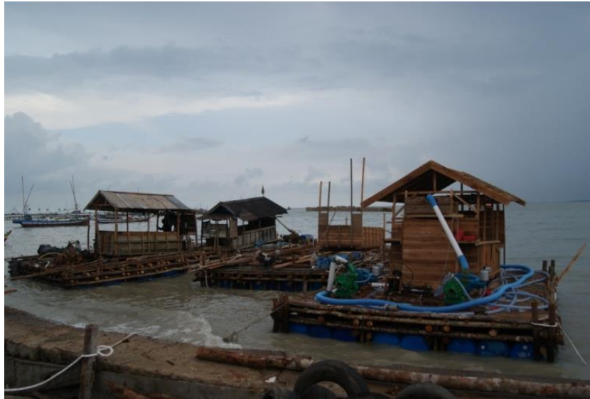
Figure 3: Apung Mining in the Coastal Area that Destroy the Beach Beauty