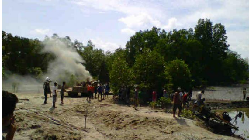
Figure 5: Unconventional Mining Equipment was burnt by People

It was basically come up because there was an interest gap. According Hutapea, et al. (2017), non-seriously managed natural resources exploitation would result in violence. In this case, all parties having conflict tended not to be able to overcome that gap, for example, as it was based on social jealousy, land seizure, the decreased income of local people, or because of the changing value and culture between new comers and local people.