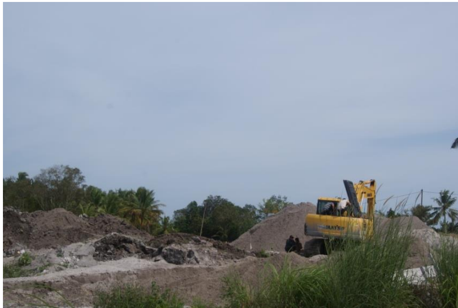
Figure 1: Mining Expansion in the Area Around Plantation

This condition caused the farmers who were previously plantation tiller patiently turned to be the victims. The author understood that farmers would in turn be in trapped by the temptation of high income; however, in short term vision. People's economy experienced shock when mining activities were not active anymore and at the same time, the plantation land had been ruined and difficult to rehabilitate.