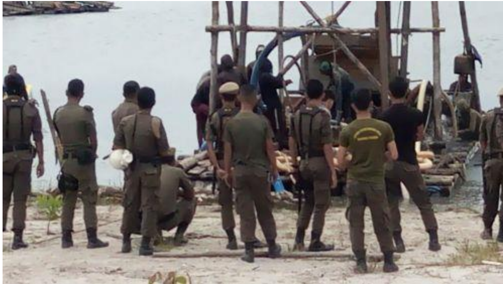
Figure 7: In conventional Mining Control in Bangka Tengah Regency