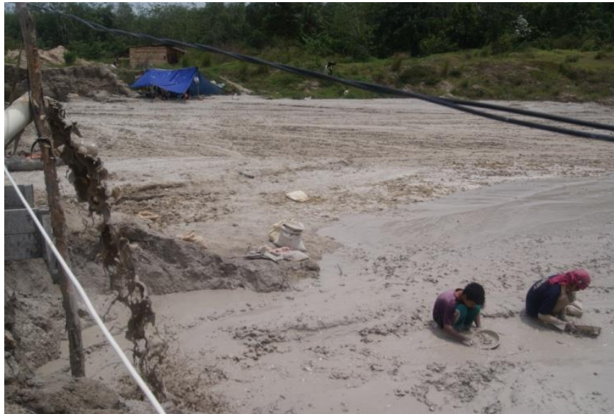
Figure 4: Children's Exploitation in Tin Mining

from local government; therefore, parents apparently do not have burden when their children must quit from their school.