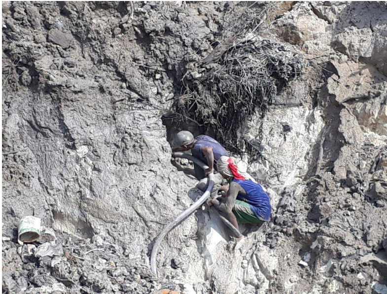
Figure 8: The Mining in South Bangka, A Risky Job